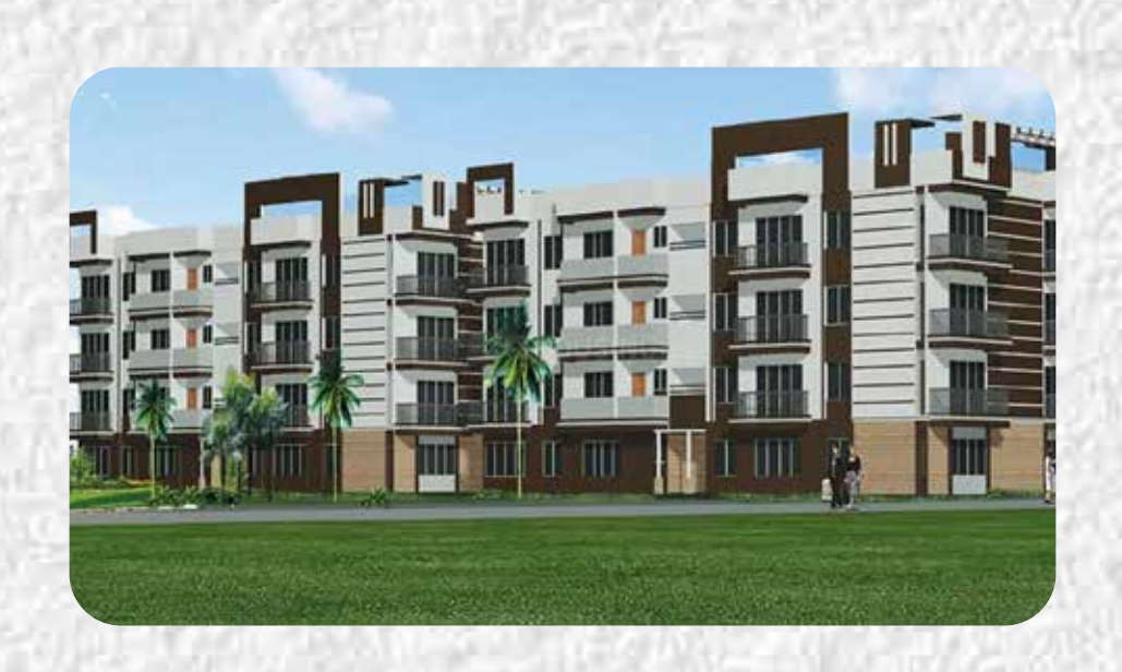
MJ Lifestyle Aldila Hongasandra, Bangalore