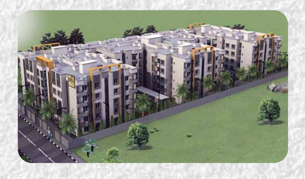
MJ Lifestyle Avershine Raysandra, Bangalore