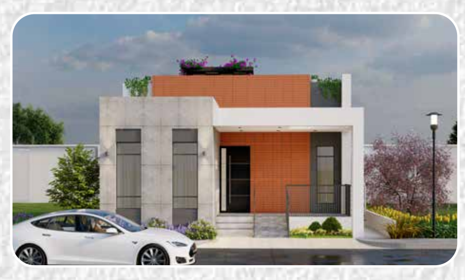
Vedaanta Premam, Coimbatore