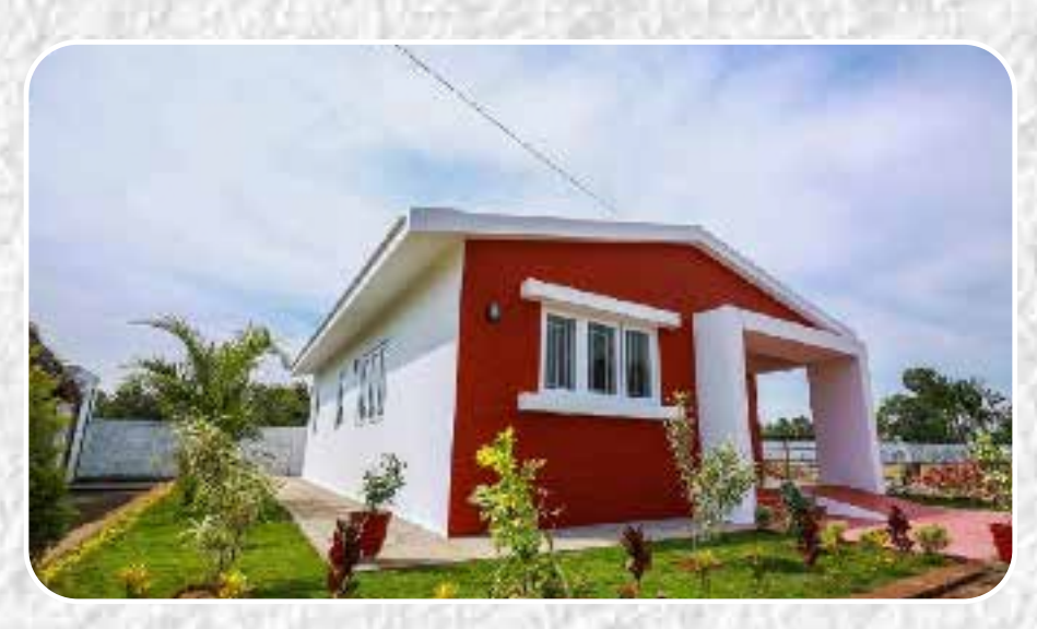
Vedaanta Brindhavanam, Kinathukadavu, Coimbatore