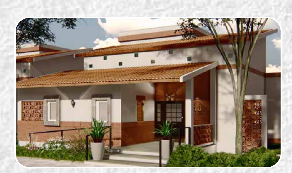
Vedaanta Vistara Coimbatore