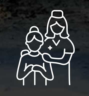
Access to Assisted Living Services