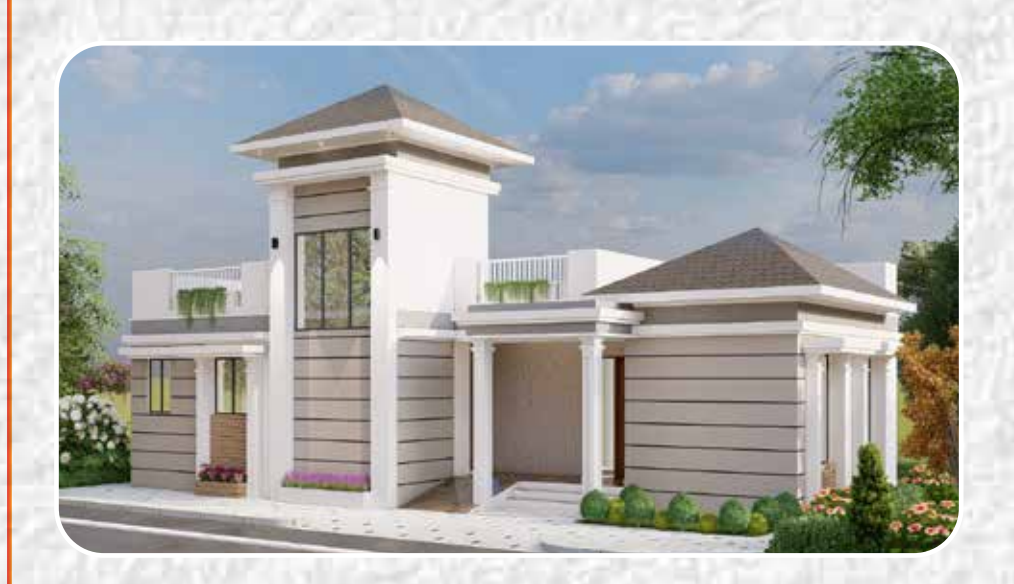
Vedaanta Anugraham Bangalore