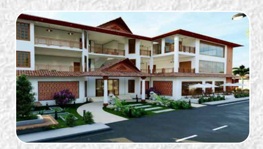
Vedaanta Utsav Hosur