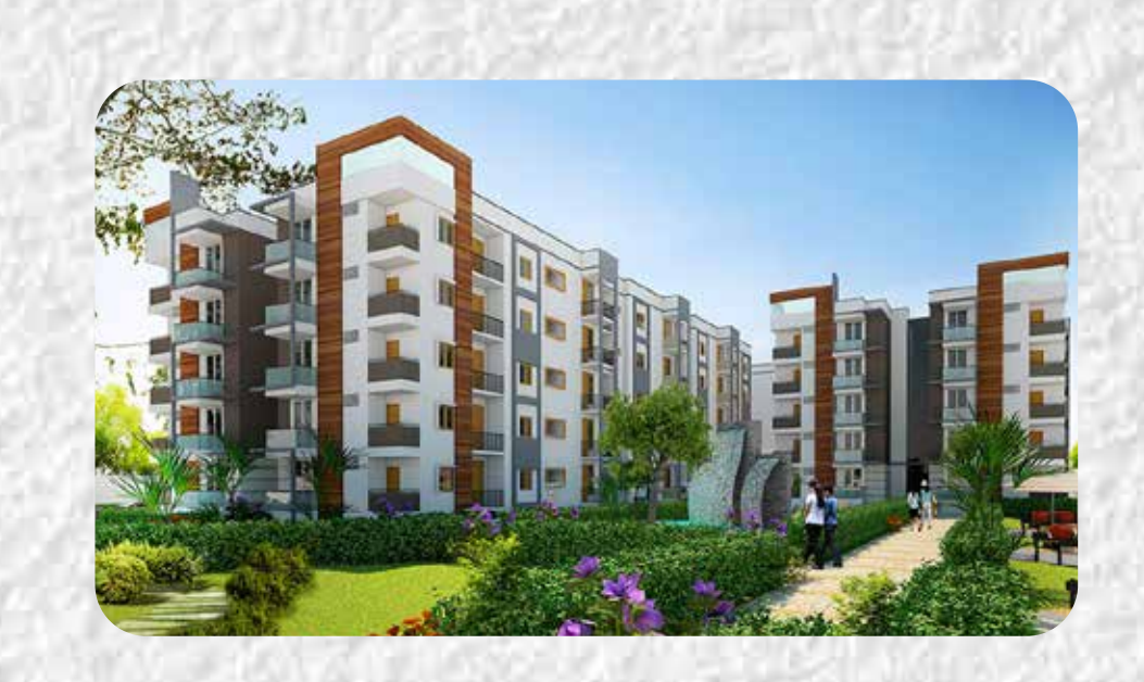
MJ Lifestyle Astro Huskur, Electronic City Phase-2 Bangalore