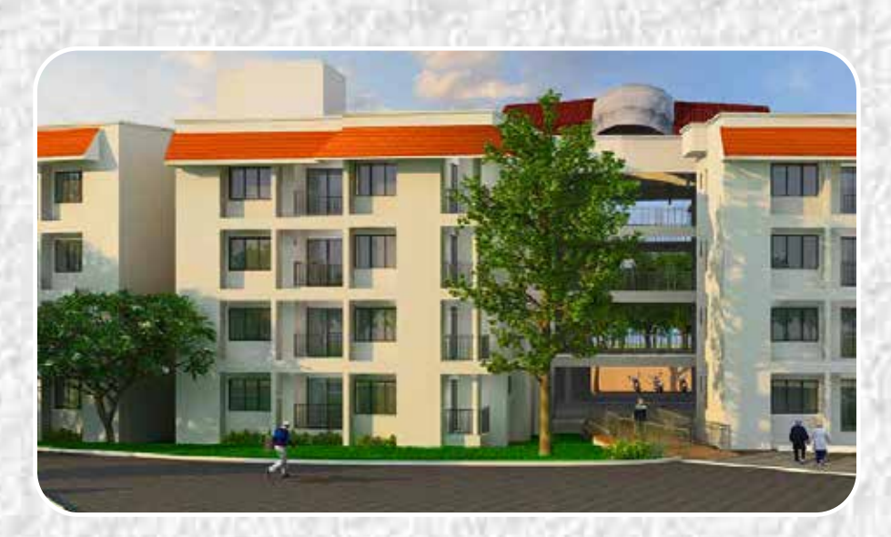
Vedaanta Verandah Gardens Cochin