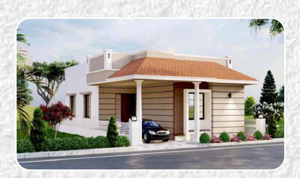
Vedaanta Nandi Retreat Bangalore