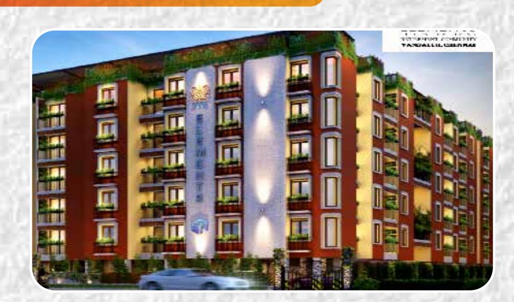
Vedaanta Elements, Andaloor, Chennai