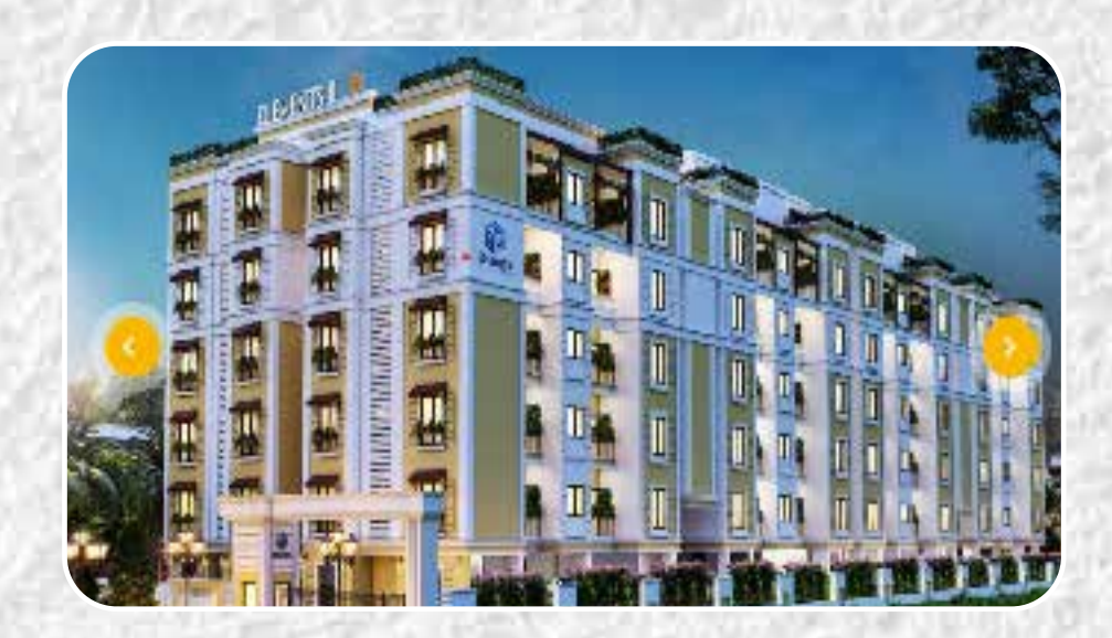
Vedaanta Elements II Chennai