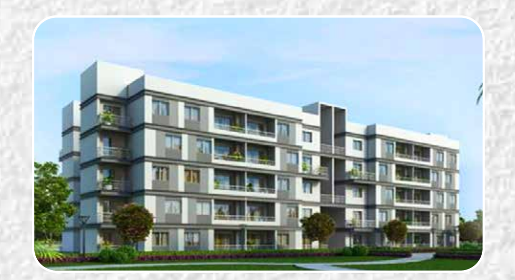
Vedaanta @ Godrej E-City Bangalore