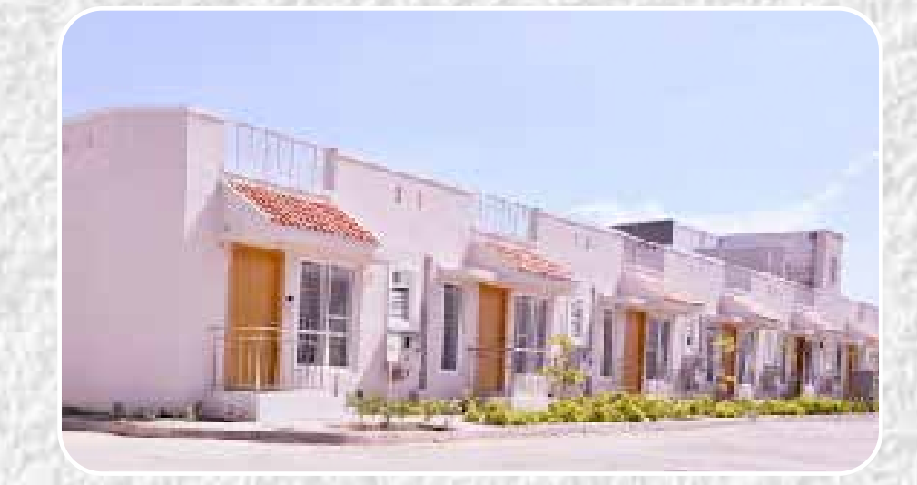
Vedaanta Hub Chennai