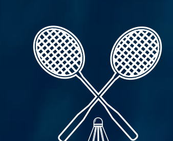
Indoor Badminton Court