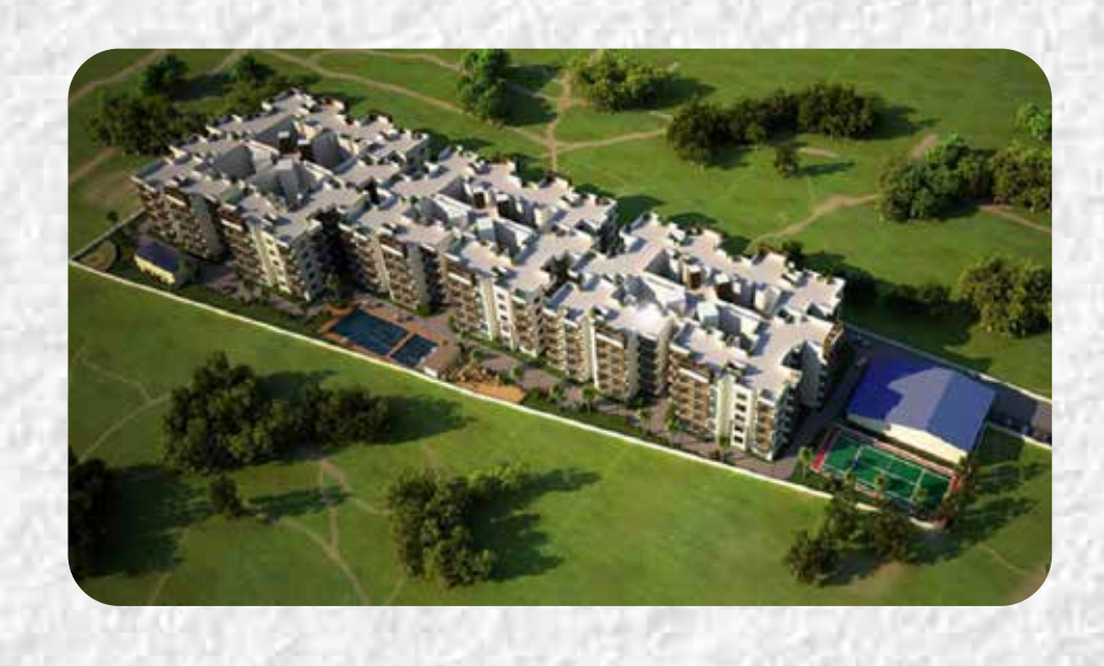
MJ Lifestyle Astyllen Choodasandra, Bangalore