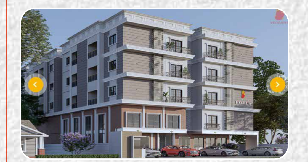
Vedaanta Lotus Guruvayoor