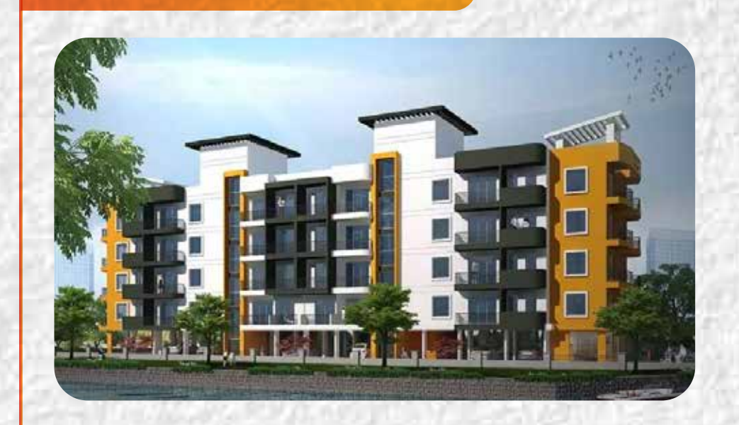
MJ Lifestyle Atria Singasandra, Bangalore